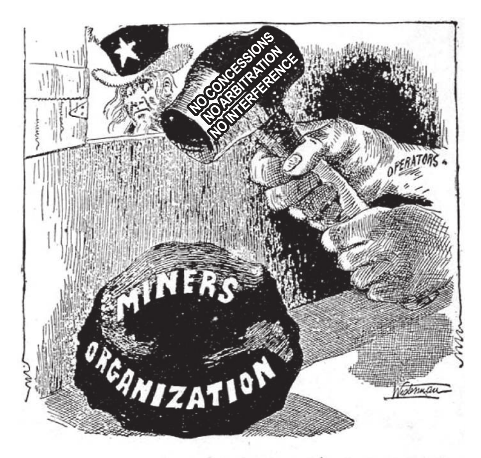
THE REAL OBJECT OF THE OPERATORS IS TO CRUSH IT.

A cartoon about the coal strike, published in an Ohio newspaper, 1902. 'Arbitration' is where an independent person makes an official judgement in a dispute. 'Operators' are the owners of the coal mines.